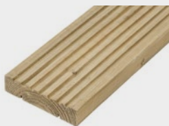
TIMBER DECKING BOARDS