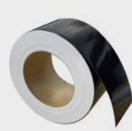
FRAME PROTECTION DECK TAPE