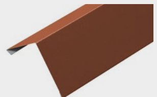
CORNER BARGE FLASHING