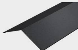
130° RIDGE FLASHING