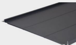
30/500 STANDING SEAM