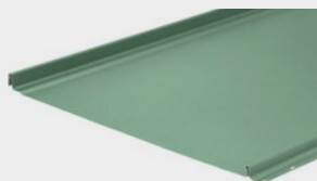
30/500 STANDING SEAM WITHOUT RIBS