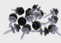
32MM MOULDED HEAD SCREWS