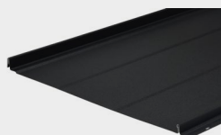
STANDING SEAM SHEETS