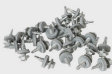
22MM STITCHER SCREWS