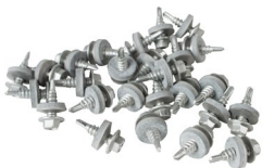
22MM STITCHER SCREWS WITH MOULDED HEAD