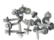
32MM SCREWS TO WOOD WITH MOULDED HEAD