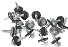
25MM SCREWS FOR STEEL WITH MOULDED HEAD