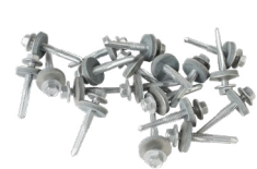
38MM SCREWS TO HEAVY STEEL WITH MOULDED HEAD